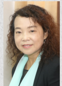
Professor Wang Xiumei College for Criminal Law Science (CCLS)

LEGISLATION AND PRACTICE OF WHISTLEBLOWER PROTECTION IN THE FIELD OF ANTI-CORRUPTION IN CHINA